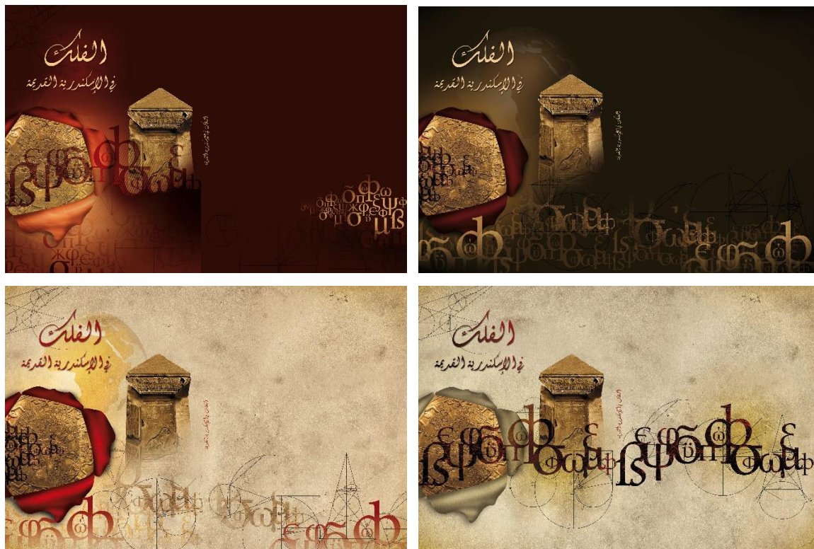
Fig. 3. Digital Book Cover Sketches