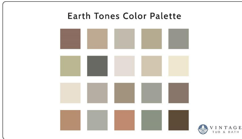
Fig. 2. Digital Book Cover Final Design