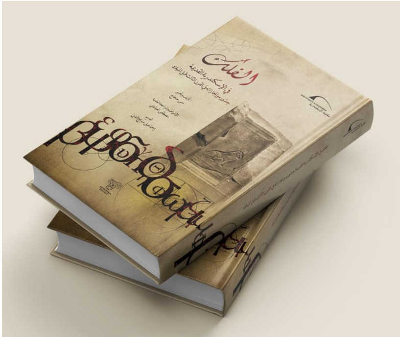
Fig. 5. Digital Book Cover Final Design

The design of the book cover for Astronomy in Ancient Alexandria: Its Roots and Achievements in the 3rd Century BC follows a classic layout style, blending both image-based and typography-based elements. The main image, Naos of Decades , visually represents the historical significance of the book, linking both the history of astronomy and the underwater monuments of Alexandria. The ancient Greek typography serves as a decorative feature, enhancing the design's aesthetic while reflecting the Greek cultural heritage of ancient Alexandria. [13]